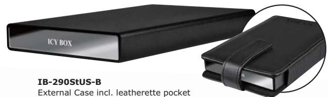
IB-290StUS-B External Case incl. leatherette pocket