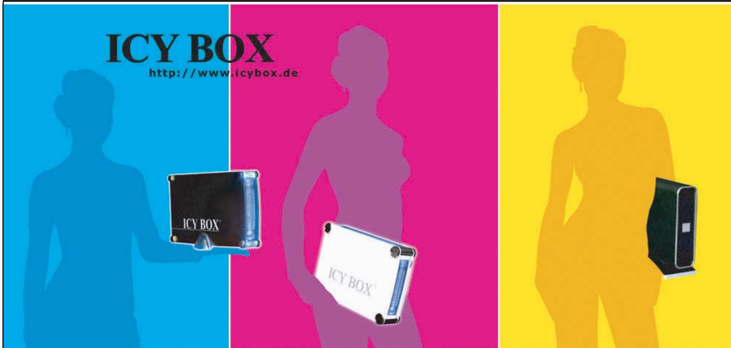
ICY BOX IB-351B-BL