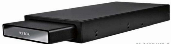
IB-290StUSD-B External Case incl. 3.5" docking station