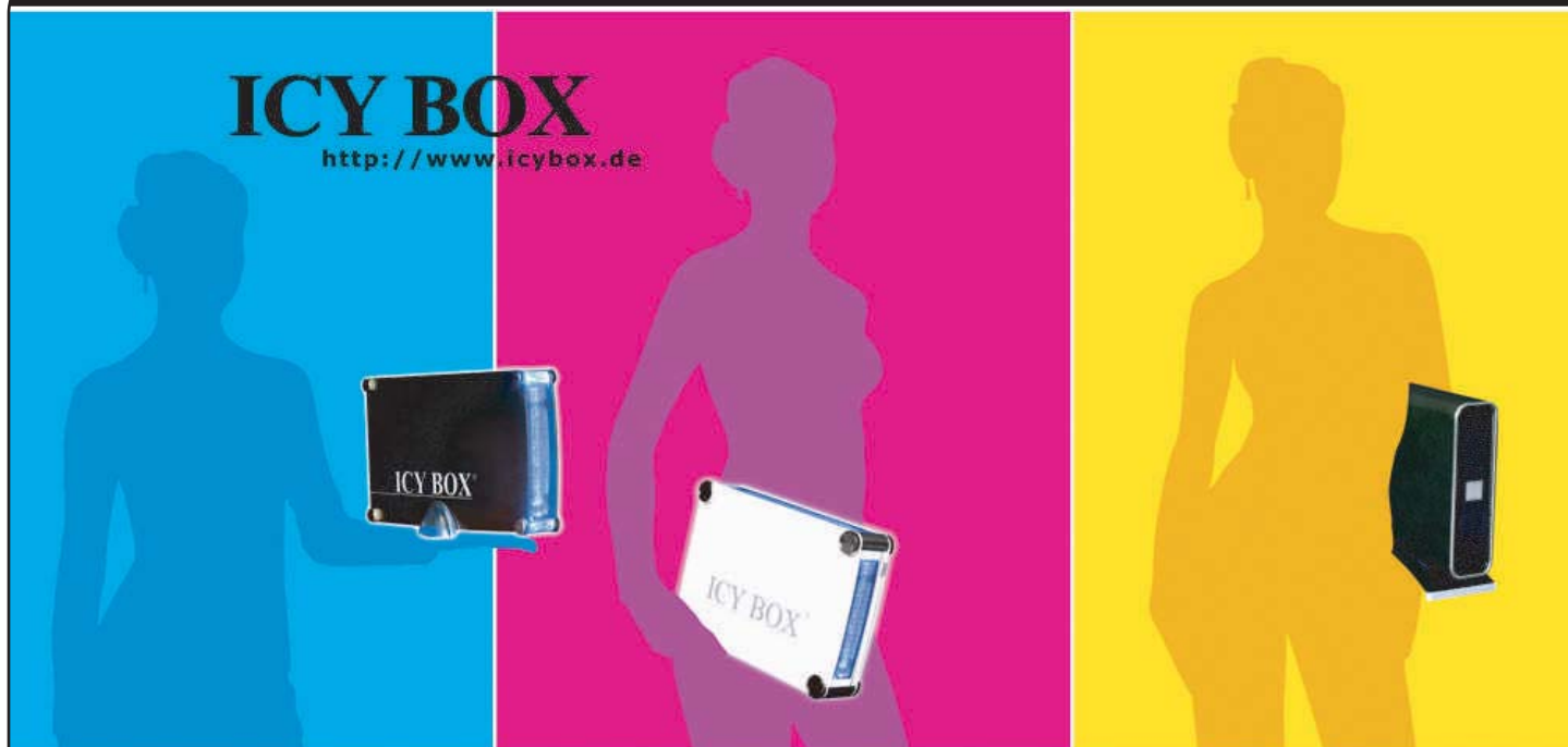
ICY BOX IB-351B-BL