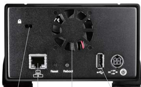
Kensington Lock Gigabit Ethernet Temperature controlled fan USB 2.0 for HDD, USB Stick or Printer