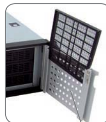
Aluminium front doors with washable and easily exchangeable filter system