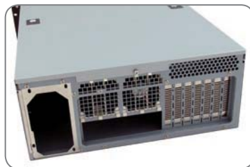
Rackmax 4U supports standard Ps2 as well as most standard redundant power supplies