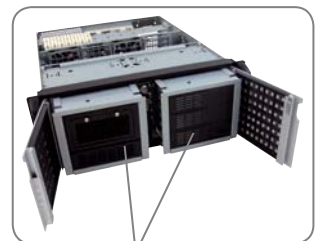
Modular cage system (3x5¼" can be expanded to 4x5¼" (separate article)