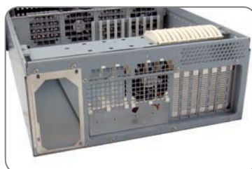
Rackmax 4U supports standard Ps2 as well as most standard redundant power supplies