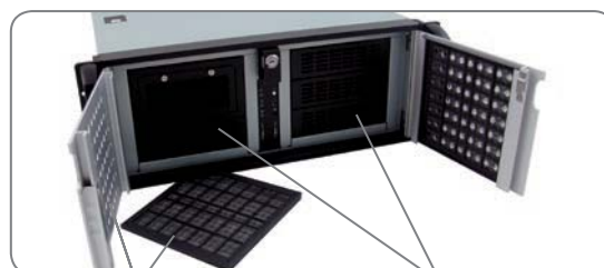
Aluminium front doors with washable and easily exchangeable filter system