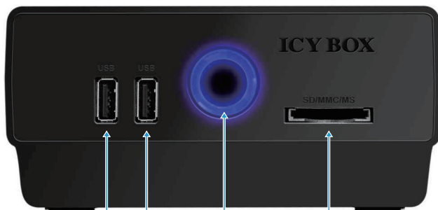
2port USB 2.0 hub